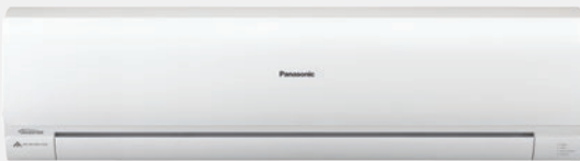
CS-RE18PKR | CS-RE24PKR | CS-RE28PKR