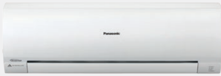
CS-RE9NKR | CS-RE12NKR